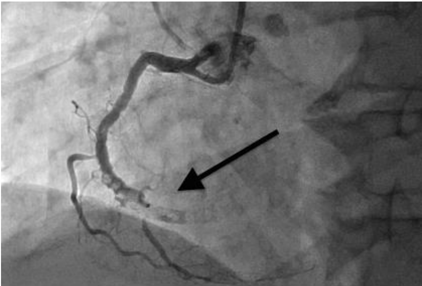
Figure 1. Left anterior oblique (LAO) view of the RCA displaying severe positive remodeling around the proximal stent and distal stent occlusion (arrow). RCA- right coronary artery