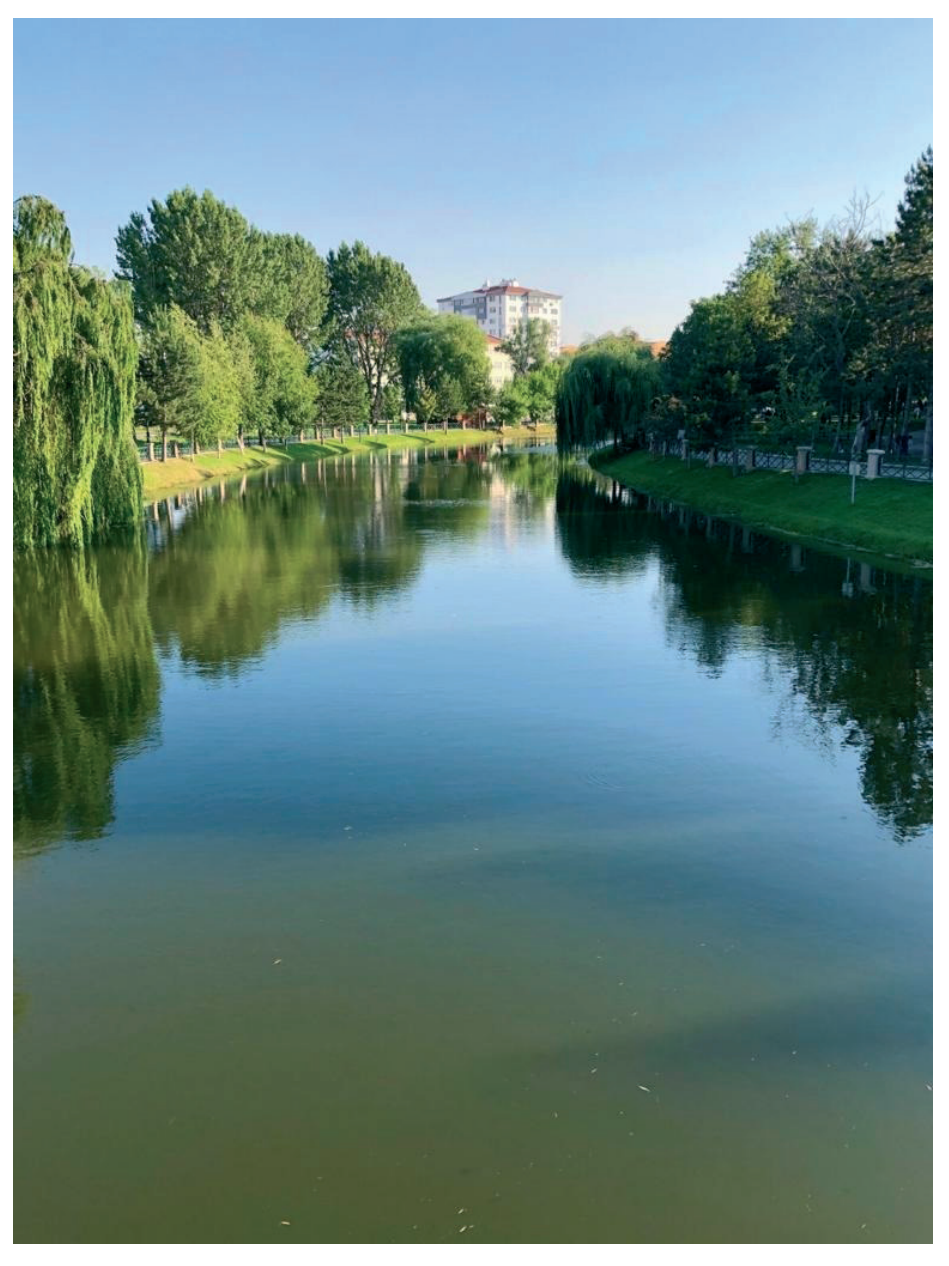
Kanlikavak, Eskisehir, Turkey. Bulent Gorenek, Eskisehir, Turkey