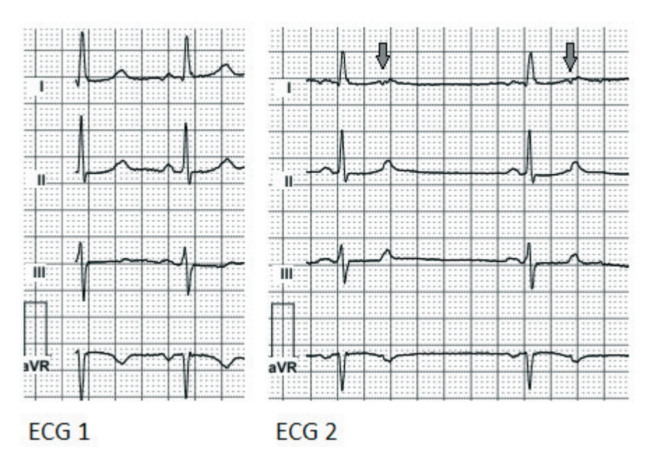
Figure 3. Blocked atrial extrasystoles

T wave morphology on the final part of ECG 2, some important difference can be noticed (Fig. 4).