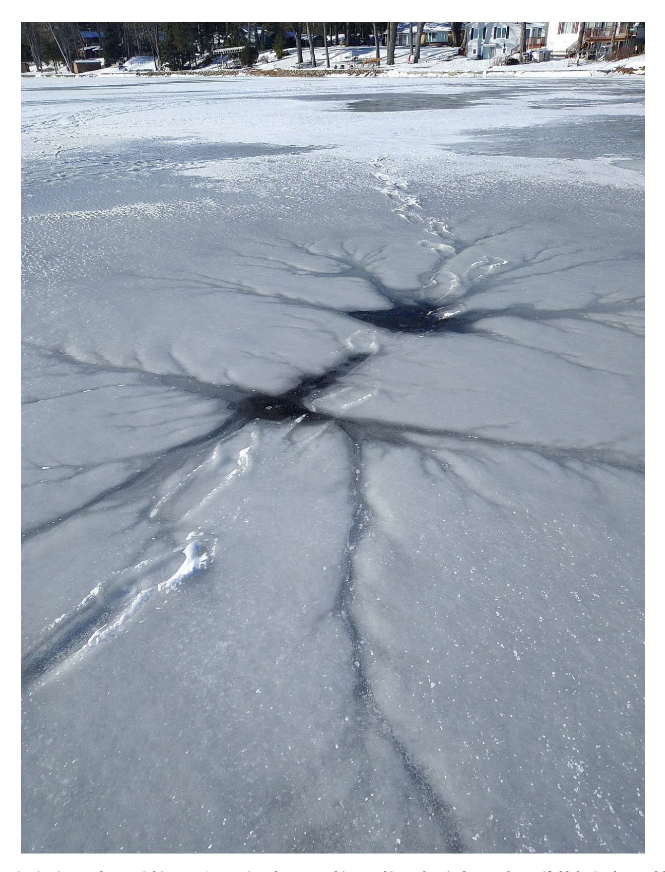
Lake Higgins in Northern Michigan, USA. National Geographic rated it as the sixth most beautiful lake in the world.

It is a glacier formed lake, and is spring fed, and is incredibly clear with an underwater visibility of 42 feet. It has an average depth of 35 feet and is 135 feet deep at most. It freezes sufficiently in winter that one can walk and snowmobile and ice fish on it. Dan Hermes, Rossomon, Michigan, USA.