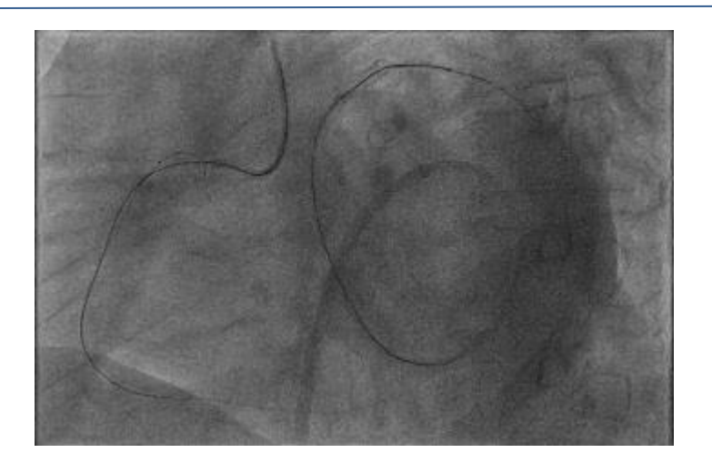
Figure 2. The retrograde wiring of RCA RCA-right coronary artery

We demonstrated that in cases when the antergrade access to CTO is not possible, femoral vein retrograde access with transseptal puncture with coronary intervention and stenting can be used successfully.