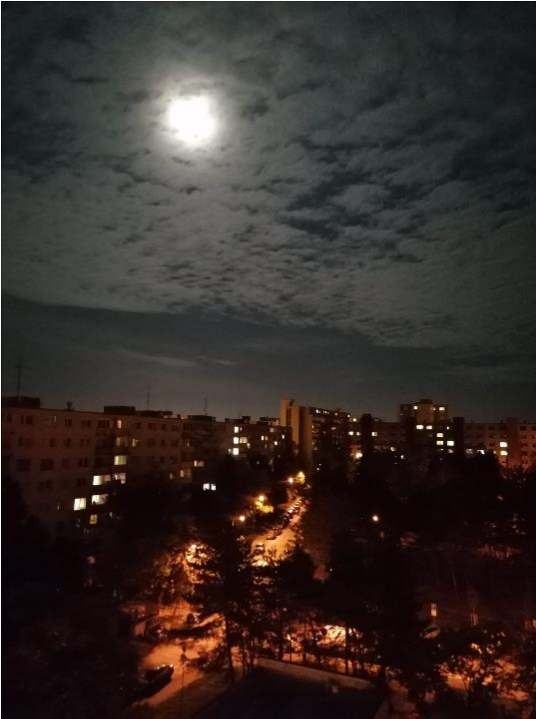
Night in Bratislava, October 2021. Ljuba Bacharova, Bratislava, Slovakia