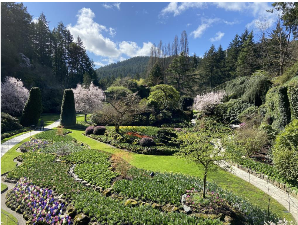
Butchart Gardens, Victoria BC, Canada.