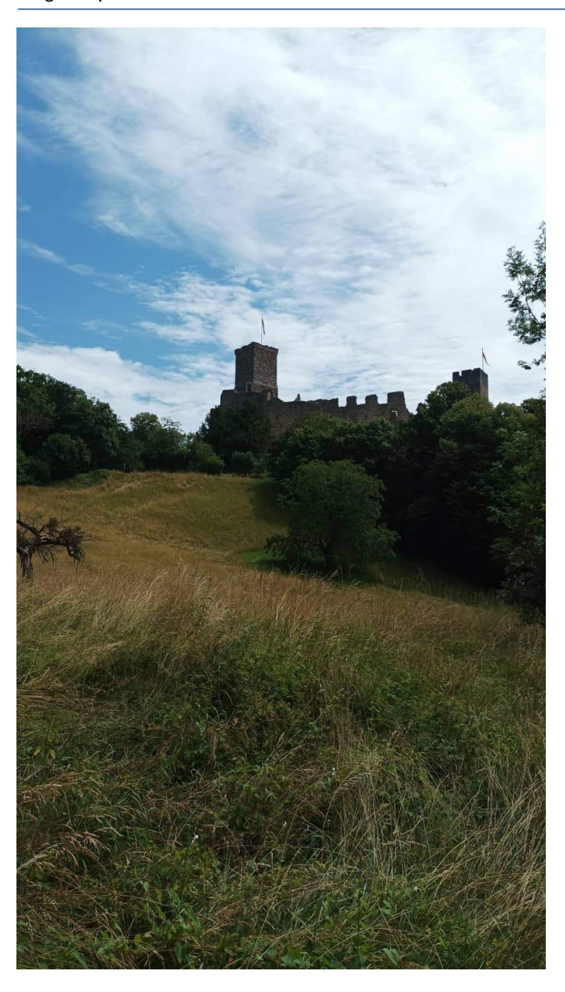
Rotteln Castle, Baden-Wurtemberg, Switzerland.