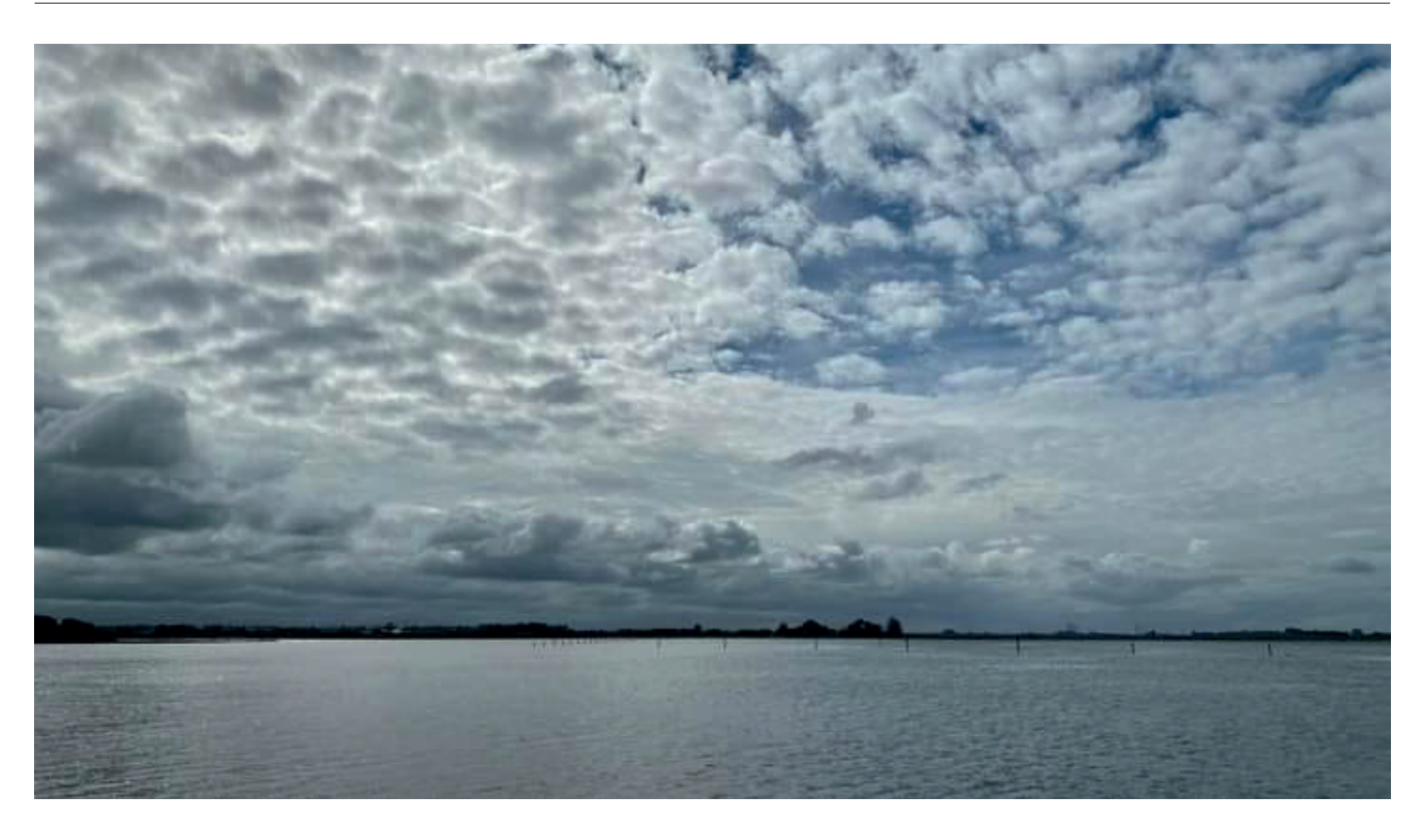
More and more like heaven in the water of Veerse lake. Zeeland, Netherlands.