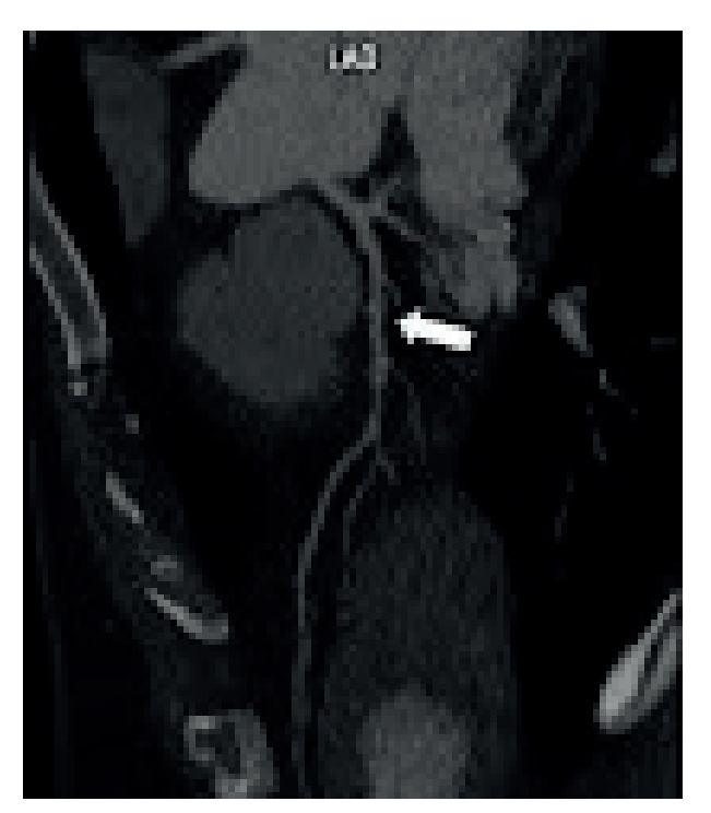
Figure 3. Example of "napkin ring sign" (arrow) in the LAD detected on CCTA. CCTA - coronary computed tomography angiography, LAD - left anterior descending coronary artery