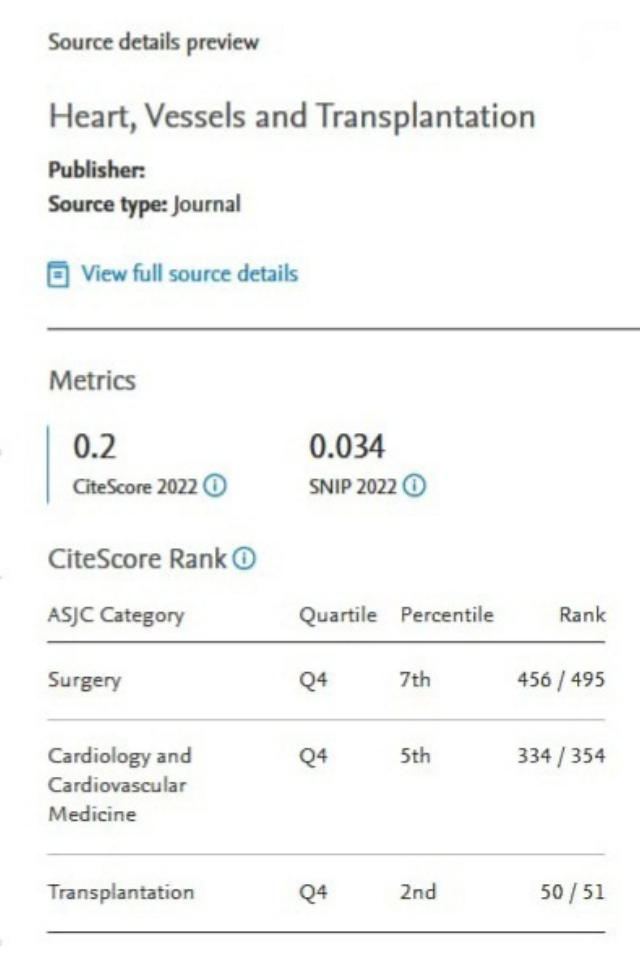
Figure 1. SCOPUS CiteScore rank for Heart, Vessels and Transplantation

In 2023 we received articles for consideration for publication from 18 countries: Argentina, Brazil, China, France, India, Iran, Italy, Kazakhstan, Kyrgyzstan, Mexico, Poland, Russia, Slovakia, Spain, Turkey, Ukraine, USA, and Uzbekistan. Thus, in total we have evaluated and published articles from 37 countries since starting our journal in 2017 and increased number of countries we received manuscripts from 13 in 2022 to 18 in 2023 (the highest was in 2021 – 24 countries).