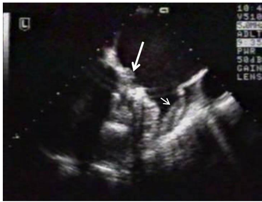
Fig. 2. Transesophageal echocardiography of thrombus obstructing the orifice of mitral valve prosthesis (long arrow). At the same time the thrombus in left atrial appendix is visualized (short arrow).

cases of technically difficult transthoracic examination it is useful to perform TEE. It is possible identify by TEE the origin and underlying mechanism of the regurgitant jets, such as prosthesis formation, dehiscence, pannus thrombus, vegetations, abscess formation or paraprosthetic fistula (20, 21). Color Doppler allows to detect a reverse flow on mitral valve prosthesis at the parasternal left ventricle long-axis view. Continuouswave Doppler (CW) can give an idea of the presence of a reverse flow, but one must be careful not to confuse it with the flow through the aortic valve. Color Doppler allows detecting whether the reverse