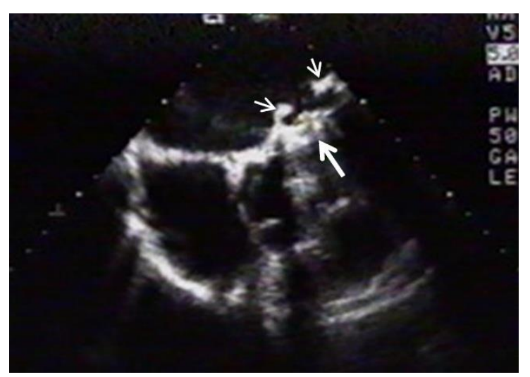
Fig. 4. Pannus formation from the atrial side of mitral valve prosthesis (short arrows) visualized by transesophageal echocardiography. Partially opened prosthetic disk is limited in its movement by thrombus (long arrow).

In a patient with a prosthetic aortic valve, a high peak systolic pressure gradient on it may also indicate that the size of the prosthesis is not consistent with the cardiac output (too small diameter of the prosthesis – patient-prosthesis mismatch – PPM). In these cases, TEE allows to find out that the prosthesis itself operates normally and there are no signs of thrombosis, pannus growing or infectious lesions. The widely used parameter for PPM identification is the indexed effective orifice area (calculated prosthetic EOA divided by the patient's body surface area). A value of indexed EOA <0.6 cm²/m² for aortic prosthetic valve and <0.9 cm²/m² for mitral valve suggests a severe PPM (42, 43).