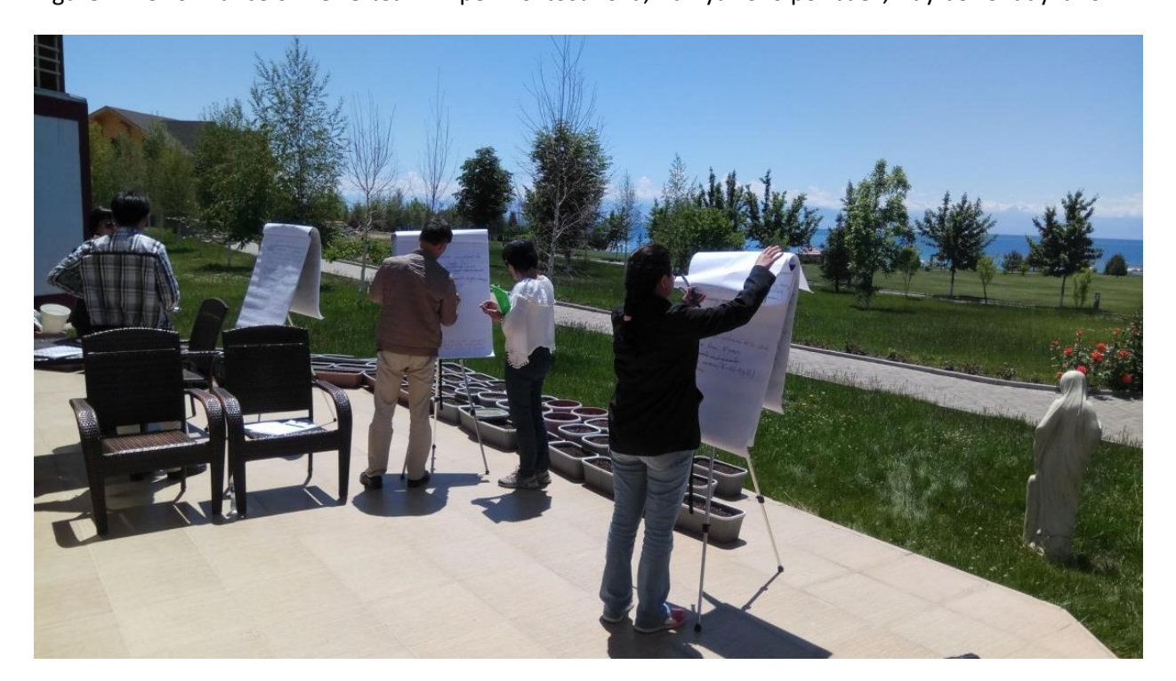
Figure 3. Working on scientific projects by teams outside.