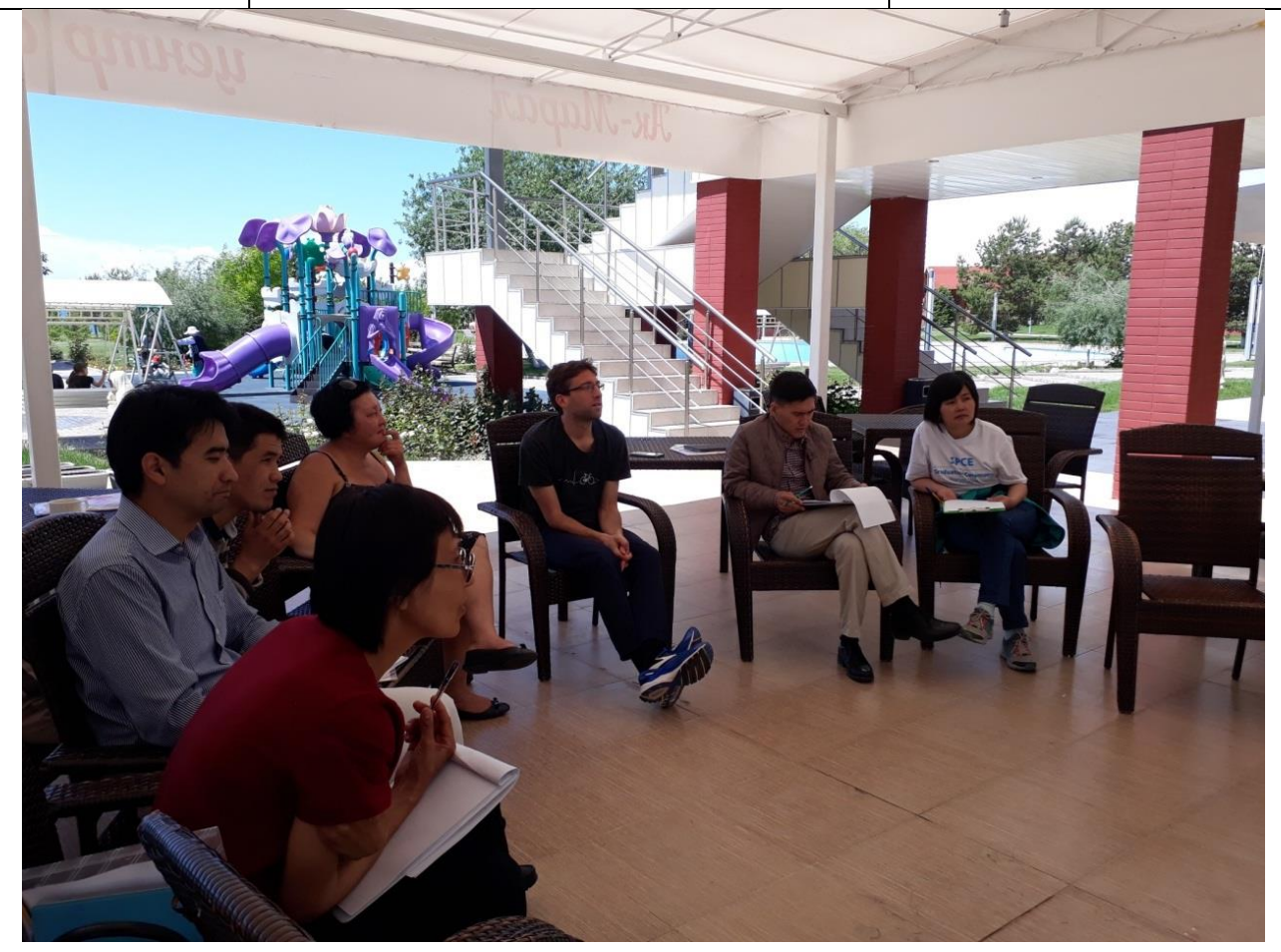
Figure 1. Discussion of the workshop: Project selection and introduction to research proposal.