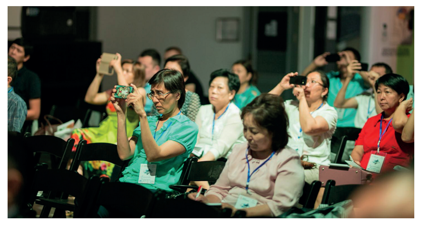
SRI of heart surgery and organ transplantation, being a leading organization on diagnosis and treatment of cardiovascular disease, in collaboration with Center for Postgraduate Education and Scientific Research and Eurasian Association of Cardiothoracic Surgeons plans to hold every

year international scientific-practical conferences events aiming at development of educational and scientific potential of all specialists interested in contemporary diagnosis and treatment of various diseases of cardiovascular system.