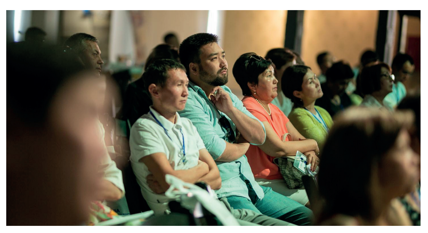
In frame of congress, there was an official opening ceremony and contest of arrhythmias management, the winner received main prize – two travel grants for participation in Russian