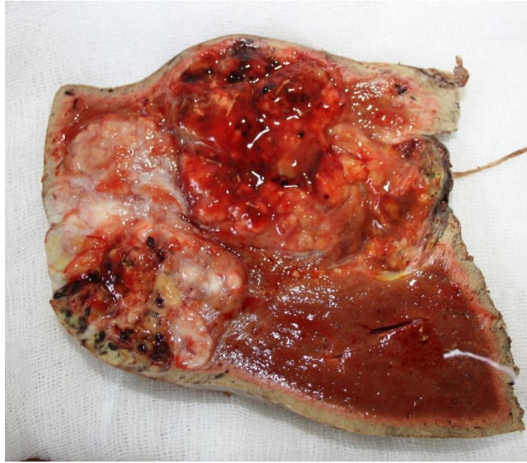
Figure 3. Macrospecimen. Uniform distribution of microparticles in the tissue of hepatocellular carcinoma in the form of multiple black foci in the central and peripheral zones of the tumor.

hepatocellular carcinoma the microparticles were distributed evenly in the central and peripheral zones of the tumor (Fig. 3).