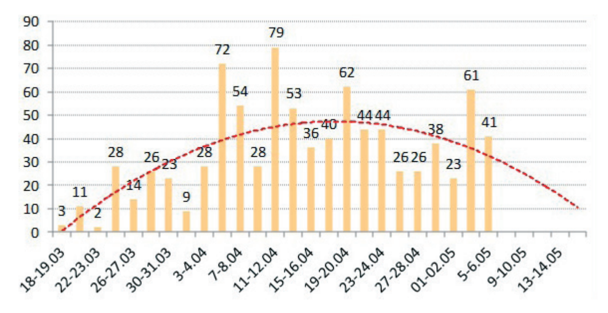
Figure 1. Dynamics of the number of cases of COVID-19 in the Kyrgyz Republic (March 19 to May 6, 2020, the absolute number of new cases is 871)

According to the forecast by the WHO methodology, the peak incidence of COVID-19 should be at the eighth week of the development of the epidemic process, amounting to 92 cases. Starting from the fifth week, the number of cases of COVID-19 tends to decrease gradually and the mathematical model for predicting the incidence of COVID-19 in the Kyrgyz Republic shows that by the end of May 2020, 97% of the total number of infected with coronavirus will be detected.