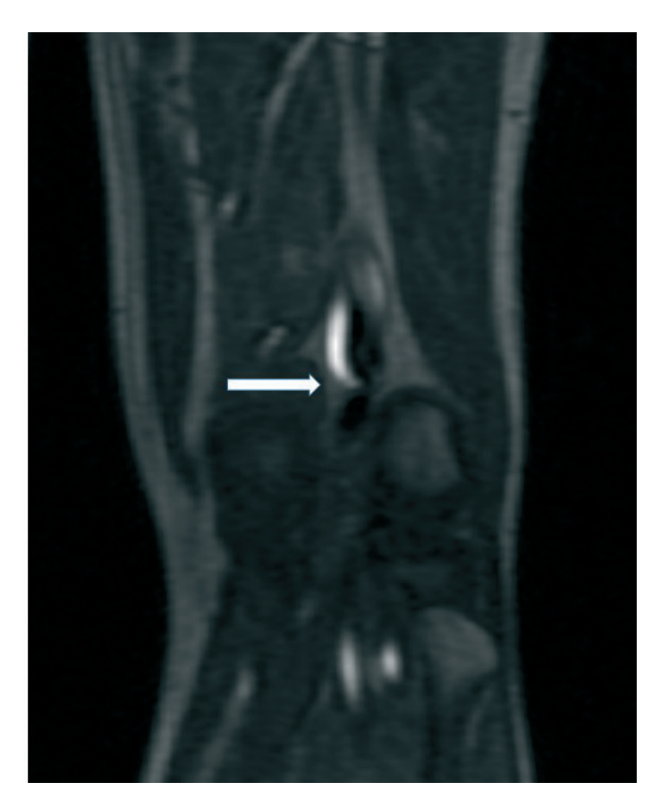
Figure 4. Magnetic resonance angiography of the same patient demonstrates mild lumen narrowing (arrow) of the popliteal artery due to the compression by the cyst from vascular wall

Figure 3. Cross-sectional T1-weighted magnetic resonance imaging of 37-year-old male patient with complaints on intermittent claudication during intensive exercise demonstrates multilocular hypointense cyst (arrow) within the wall of the left popliteal artery