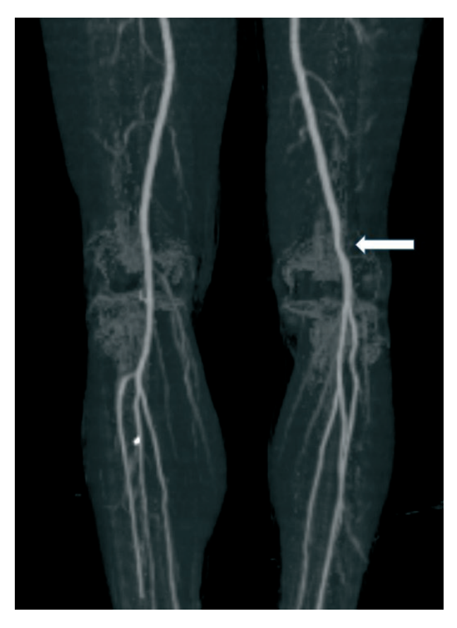
Figure 2. Computed tomography angiogram with "maximum intensity projection" technique of the same patient demonstrates an eccentric compression of the left popliteal artery by the cyst causing mild stenosis (arrow)

Figure 1. Cross-sectional computed tomography of 35-year-old male patient with complaints on intermittent claudication during routine walking demonstrates semi-circumferential cyst (arrow) within the wall of the left popliteal artery