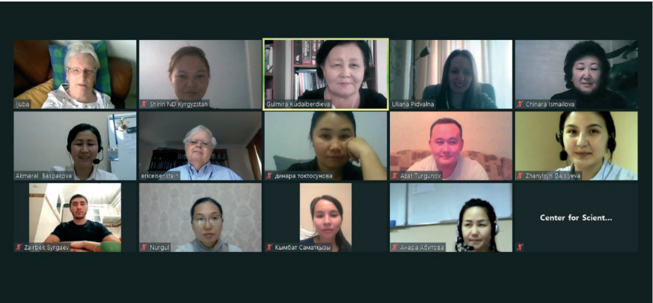
Figure 3. Workshop - discussions of projects