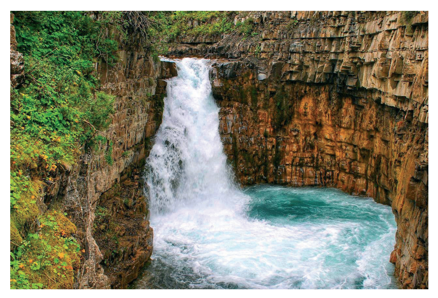
The Tekes waterfall, Almaty region, Kazakhstan, August 2020. Dina Dyusupova, Aktobe, Kazakhstan