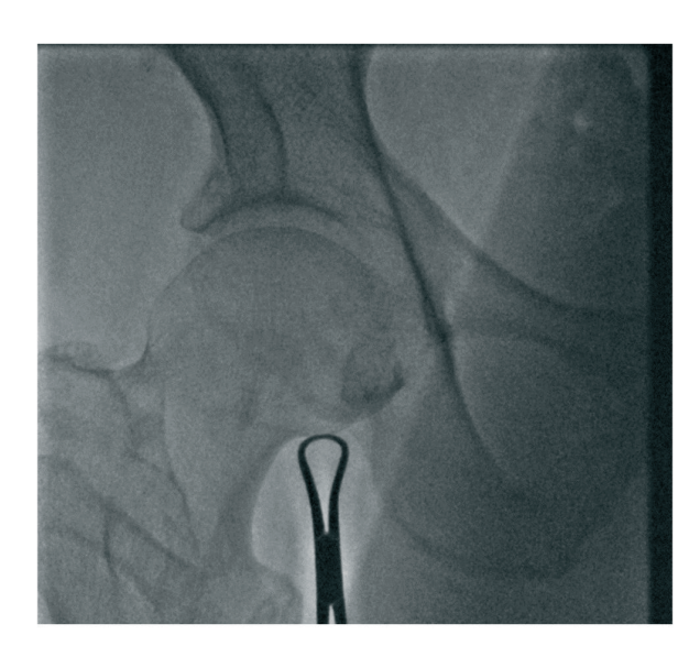
Figure 3. Identification of the lower edge of the femur head with fluoroscopy as a reference point.

Figure 2. Relevant regional anatomy for femoral artery catheterization: A: Common femoral artery. B: Deep femoral artery. C: Superficial femoral artery. D: Inguinal ligament (dashed line). The illustration shows the femoral artery running under the inguinal ligament. The arterial puncture site (indicated by the X) should be performed approximately 3 cm below the inguinal ligament.