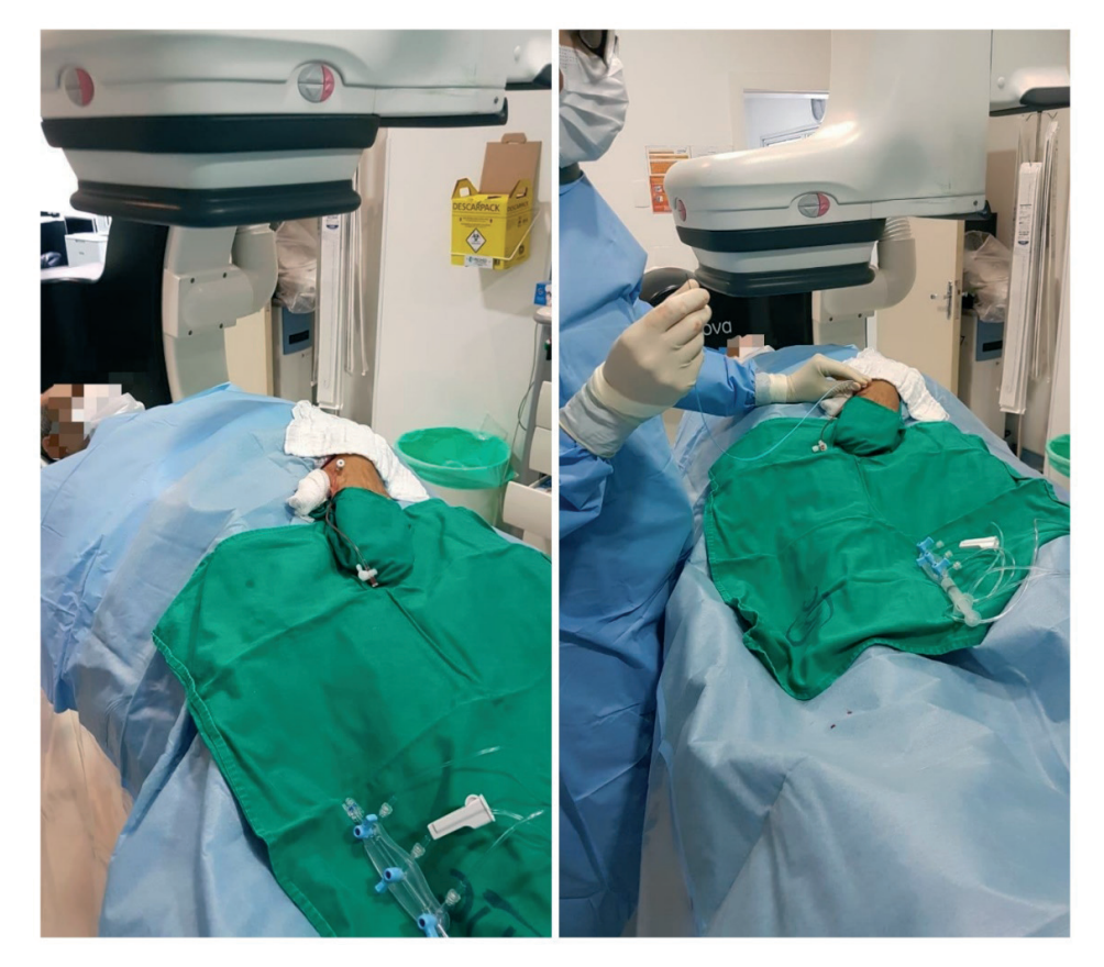
Figure 1. Position of the patient's arm during examination performed by the distal radial route

To perform the procedures in interventional cardiology through the transfemoral route, it is important to puncture the vessel in the middle of the common femoral artery, above the bifurcation of the femoral artery in superficial and deep, and 2-3 cm below the inguinal ligament.