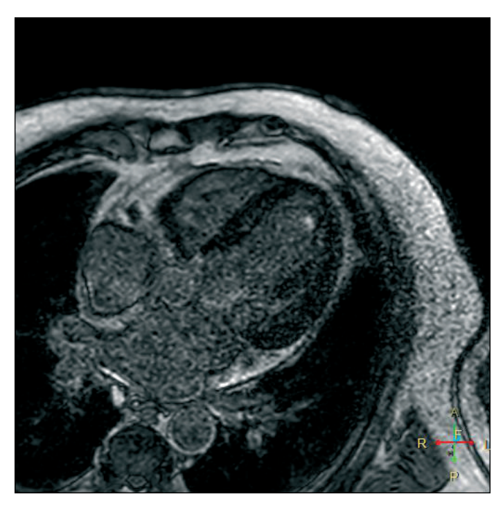
Figure 2. A 4-chamber view LGE CMR CMR - cardiac magnetic resonance imaging, LGE - late gadolinium enhancement