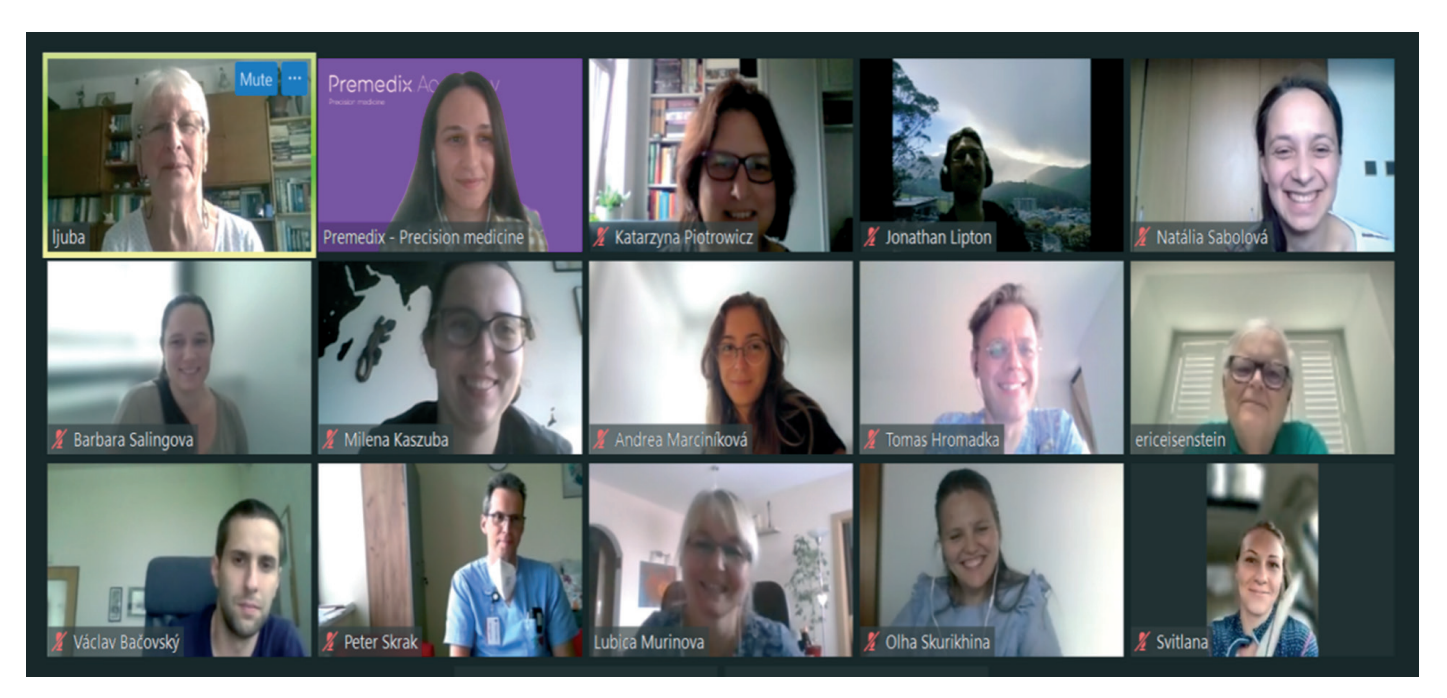
Figure 1. The faculty photo of IRIS Slovakia 2021

Acknowledgement and funding: IRIS Slovakia 2021 was sponsored by Pfizer. We thank Pfizer for recognizing the need of training soft skill for young researcher