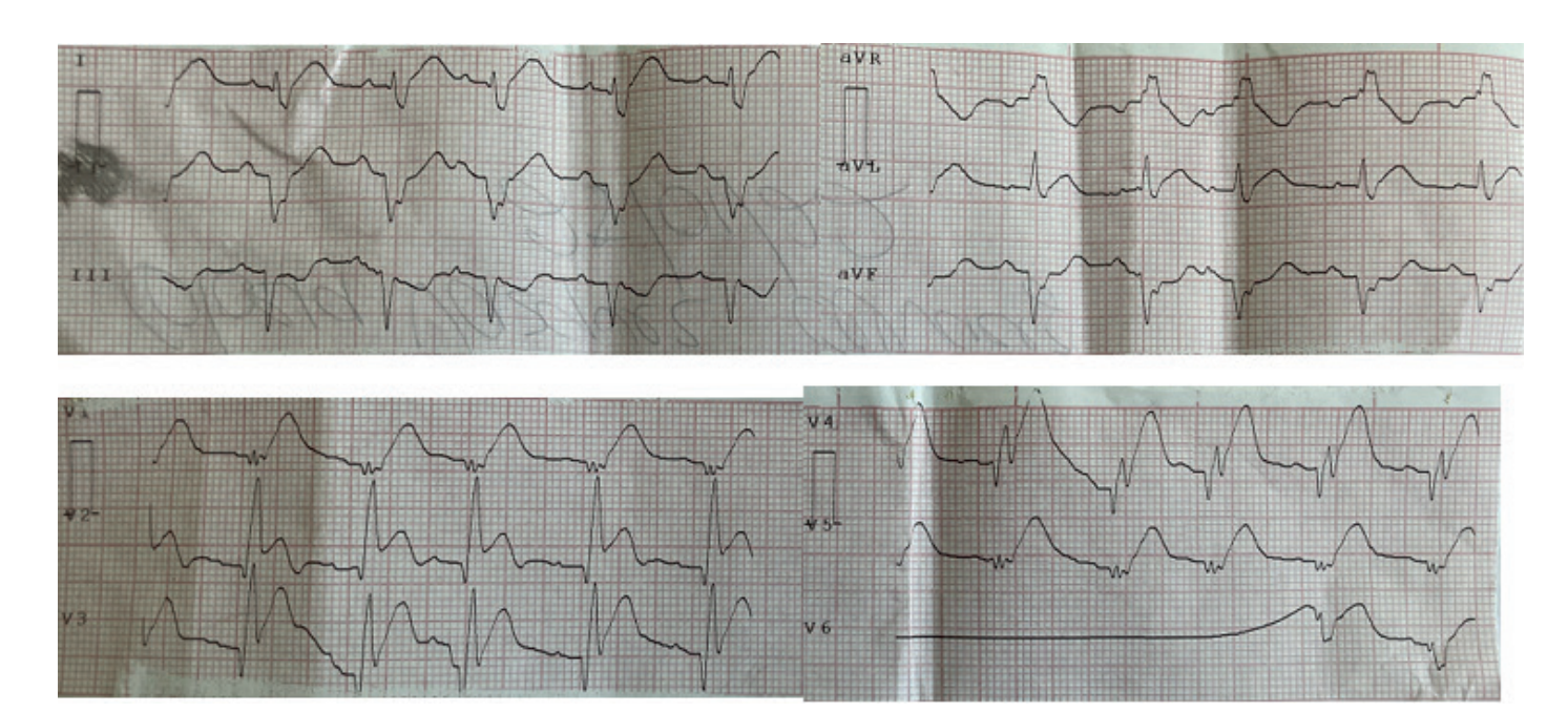
Figure 1. Electrocardiogram showing ST segment elevation from V1 to V6

the LAD emerged as the only vessel with 90% lesion in the proximal segment (Fig. 3). Percutaneous coronary intervention was performed with deployment of a drug-eluting stent with a successful result (Fig. 3).