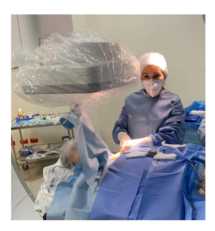
Figure 1. In catheterization laboratory

This has been the path of my professional present, as well as that of all my colleagues.