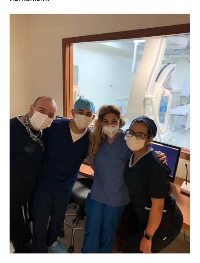
Figure 2. With colleagues

We continue on the path to the Future, not only knowing the function of DNA, the physics and chemistry of life processes, the expression of more than 100 billion neuronal connections... But, uniting more and more health professionals, in science, technology and humanism.