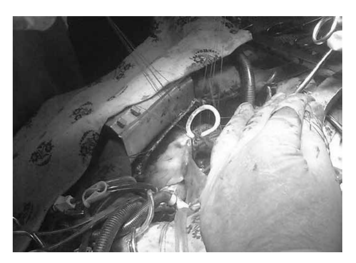
Figure 1. Intraoperative view of tricuspid valve annuloplasty with support rings

To prevent the development of some postoperative complications, one needs to navigate the surgical anatomy of the anteriorseptal commissure, where the bundle of His is situated, to avoid development of a complete atrioventricular block. Also, lying sulcus coronaries extends right coronary artery trunk in the frontal cusp zone (3-4mm from FR) and commissures in the area of the side and caution should be applied not to damage coronary artery and cause complication like myocardial ischemia and infarction. The process of stitching on the fibrous ring of plastic is made with strict regard to the anatomy of the conduction system and the right coronary artery. Our patients did not have such complications in form of atrioventricular block or myocardial ischemia and infarction.